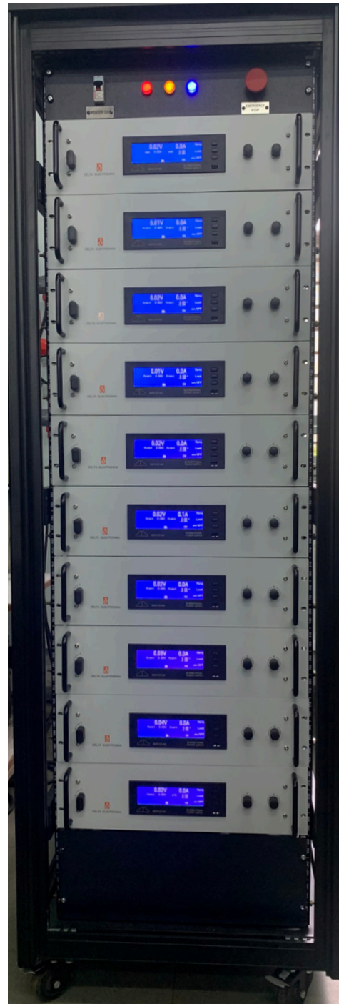
Figure . The rack uses 10 Delta Elektronika Bi-Directional units