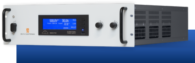
SM15K Delta Elektronika